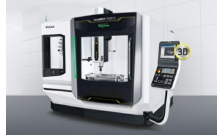
ECO MILL 1100V

This is one of our latest machines with 5 axis simultaneous machining, swivel rotary table 12,000 rpm spindle and a 24 position tool changer, and probe inspection