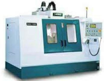
YANG EAGLE 600

This machine incorporates twin pallets with rotary trunnions, a Microlock work holding system, 20 tool magazine, a 12,000 rpm spindle.