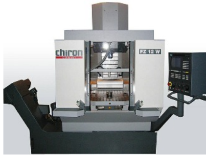
CHIRON FZ12 W

This machine incorporates twin pallets with rotary trunnions, a Microlock work holding system, Renishaw probing system, 48 tool magazine, high pressure coolant and a 15,000 rpm spindle.